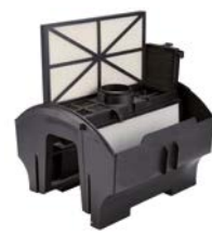
Top access to filter panel for simple maintenance. The filter panel is easy to remove, easy to clean and easy to replace RCX70101PAK2 (Included).