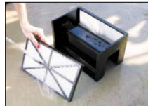
Filter panels that are easy to remove, clean and replace