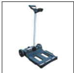
The supplied trolley allows you to move and store the cleaner quickly and easily