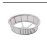
Supplied with its separation filter RCX361511243