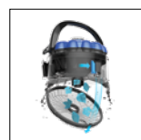
TouchFree™ innovative debris cannister