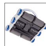
Foam version: for tiled, mosaic and stainless steel pools