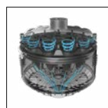
SpinTech™ a constant suction power