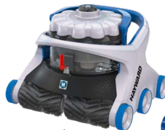
AquaVac® 600 Brushes version