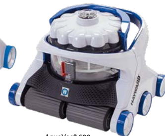
AquaVac® 600 Foam version