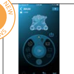
Tug & Catch™ Function: easily retrieve your cleaner from your pool (AquaVac® 650 model only)