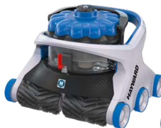
AquaVac® 650 Brushes version