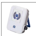
Light and easy to use power supply