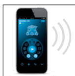
Wi-Fi app with AV650 for iPhone®, iPad® and Android devices