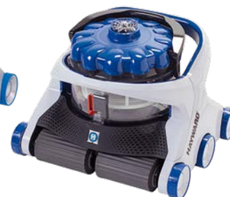
AquaVac® 650 Foam version