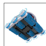
Brushes version: for liner, PVC, fibreglass, concrete pools