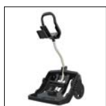
Caddy cart included